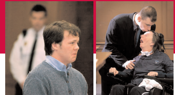
Two sides of the tragedy of underage drinking

Yes. An exception to the Social Host Law allows you to serve alcohol to your children and grandchildren. However,